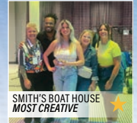
SMITH'S BOATHOUSE MOST CREATIVE