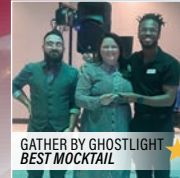
GATHER BY GHOSTLIGHT BEST MOCKTAIL