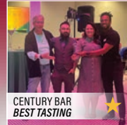
CENTURY BAR BEST TASTING